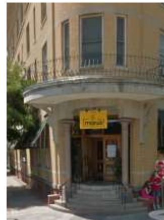
Fig. 1: Stuyvesant Hotel, Kingston, NY. Designed by John A. Wood, constructed in 1910 at the corner of John and Fair Sts. Today a restaurant occupies the street level, making use of the historic main entrance (shown adjacent).