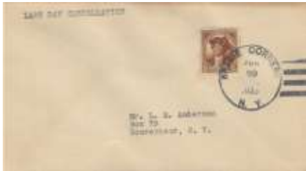
Lot 12 Last Day of Service Jun 29 1935 BRASIE CORNERS (St. Lawrence). #706 pays 3 rd Class Single Piece rate. Min: $3