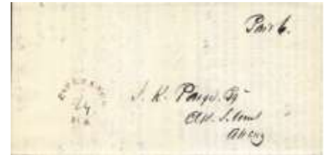
(*) Lot 30 Court doc. sent by attorney from ESPERANCE (Montgomery) to Albany June 24 (1842). Ms. Paid 6. Very good condition. Min: $50