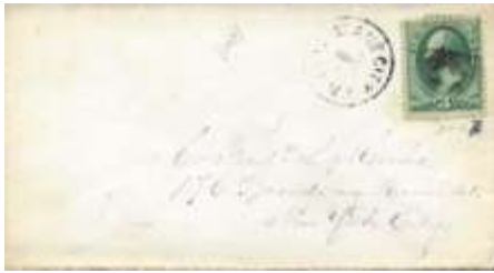
Lot 10 Legible LONG ISLAND CITY C-24 (Queens) w. cork killer on #147 to NYC. Elaborate monogram on reverse of mid-size stationery. Min: $3