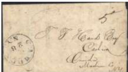
Lot 14 Legible CAMDEN (Oneida) C-32 of Jun 28 (1852) w. ms 5 on interbank

form letter protesting non-payment, sent post unpaid. Min: $7