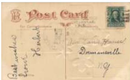
Lot 24 RDF uptake to GREENVILLE (Green) on 1908 p/c. Faint DORMANTVILLE postmark upon arrival. Min: $3