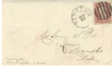
Lot 2 Oct 27 (NYD) NEW-YORK DC-25 w. exquisite 6 bar killer. On #65. Fine envelope reduced left. Hinge remnants on reverse. Min: $13