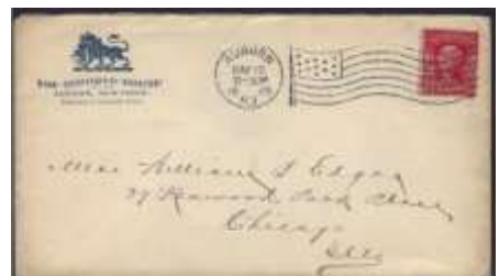
Lot 9 Clear AUBURN (Cayuga) flag cancel machine May 10 1908 on corner card envelope of The Osborne House . Slight toning, o/wise good. Min: $3