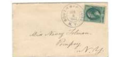
Lot 29 Fine 1882 SOUTH SYRACUSE (Onondaga) duples on small ladies cover to Pompey. DPO-4. Min: $4