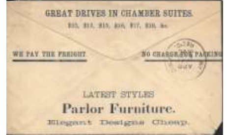
Lot 18 1896 JAMESTOWN C-27 with duplexed target ellipse ties #252 to neat all-over advertising cover. Sliced open at left with small tear. Min: $15