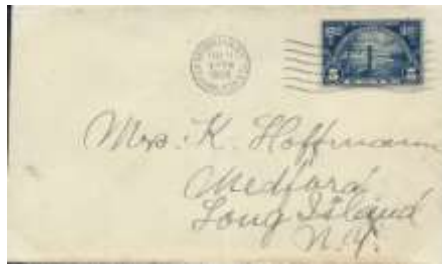
Lot 16 BROOKLYN, NY FT. HAMILTON STA. machine ties #616 to Medford, NY Env. Reduced at left with central file fold. Cat. $20; Min: $8