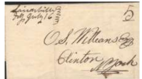
Lot 32 Manuscript Lairdsville / NY July 16 (1850) FLS enclosed $5 for legal case Min: $22