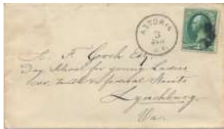
Lot 17 Clear ASTORIA (Queens) C-25 duplex on 1882 cover to Virginia. DPO-2 (1842-1888). New York transit and Lynchburg Va. Rec'd on reverse. Min: $13