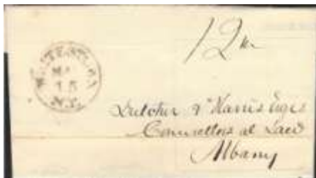
Lot 1 WHITESTOWN (Oneida) C-30 on XF folded court document. 12½ rate to Albany. May 15 (1835). Min: $7

Bob Bramwell PO Box 4150, Pinehurst NC 29374 rbramwell@nc.rr.com