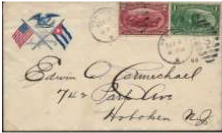
Lot 21 Spanish American War patriotic from New York (Station S). Colorful Trans-Miss franking on XF cover. Min: $12