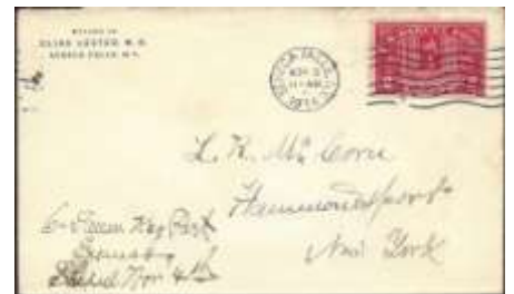
Lot 20 Doctor's C/C franked with Q2 paying 2¢ letter rate to Hammondspport bears SENECA FALLS (Seneca) 1914 International machiner. Min: $3