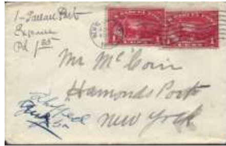
Lot 25 19113 NEW YORK STA. H tie Q1 pair to Hammondsport. Return address on back flap. Min: $4