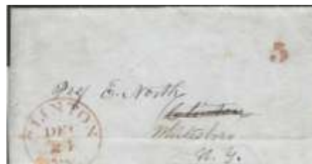
Lot 28 Dec 21 (1845) CLINTON C-30 (Oneida) on preprinted invitation to an Agricultural Ride and Supper . Min: $7