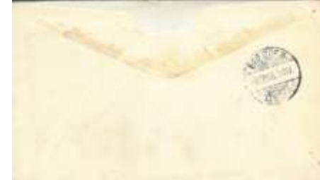
Lot 15 Neat blue attorney corner card w. 1908 strike of BUFFALO International Postal Supply machine to Dresden. #304 pays 5¢ UPU rate to Germany. Clear Dresden postmark on reverse; flap removed. Min: $4.50