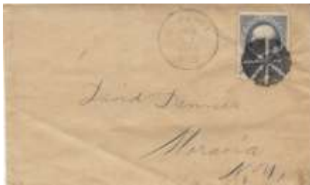
Lot 23 1¢ drop rate letter bears light but legible MORAVIA (Cayuga) C-25 with exquisite "sand dollar" cancel. Hinge remnants, otherwise fine. Min: $3