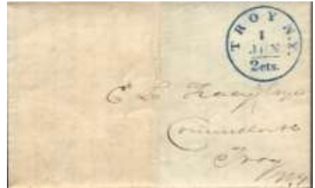
(*) Lot 7 XF TROY (Rensselaer) 2cts. Integral drop rate C-32 on fine FLS. Seal removed 3 words only. Min: $25