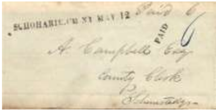
(*) Lot 11 Complete, well-struck May 12 SCHOHARIE, CH. NY. datelined 1841 w. PAID stamp, blue 6 and ms Paid 6. FLS has small separation repaired with archival tape; seal removal affects one word. Cat. Value $175. Min: $75