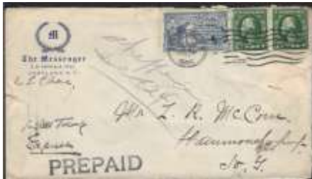
Lot 22 1915 Int'l machine CORTLAND double strike on C/C of The Messenger sent Spl. Del. To Hammondsport. Impressive PREPAID hand stamp. RPO h/s on reverse. Several faults but over all good cover. Cat. $55.50 Min: $30