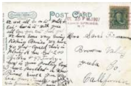
Lot 5 Full RFD MADRID SPRINGS (St. Lawrence) S/L on 1907 card. Min: $3