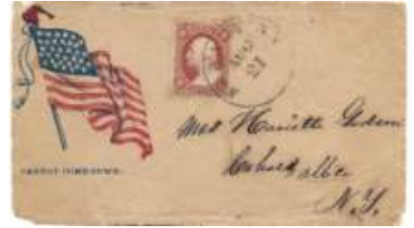
Lot 6 Clear ALBANY C-32 ties #26 to Aug 21 (1861) patriotic to Cohoes. Fragile paper has several splits. Min: $40