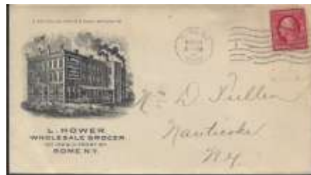
Lot 27 1909 ROME (Oneida) Universal machine on handsome adv. c/c with Whitney Point receiver on verso. Min: $6