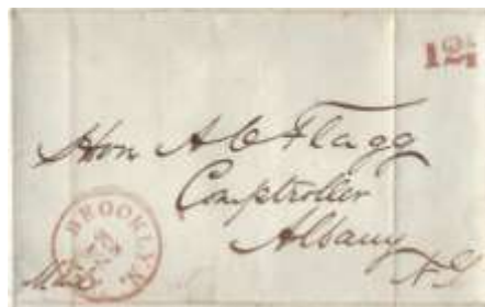
(*) Lot 4 Sharp BROOKLYN (Kings) C-30 on XF FLS with sharp strike of scarce red 12½ rate. June 12 (1845) Min: $20