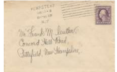
Lot 31 Columbia machine device used in HEMPSTEAD (Nassau). 3¢ purple pays war surcharge rate. Min: $3