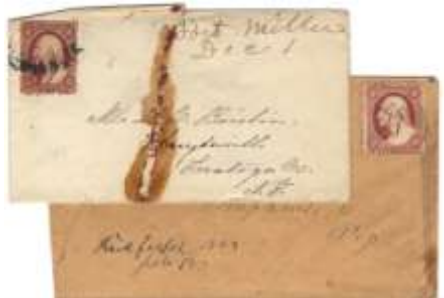
Lot 13 2 damaged covers with DPO-1 manuscripts. FORT MILLER (Washington) 1802-1966 with #25 and RICHFIELD (Otsego) 1830-1933 with #11A. Min: $35