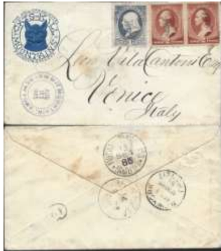
Lot 3 Perfect SUMMIT MOUNTAIN, NY (DPO-4; Ulster) on hotel adv. envelope to Venice, Italy. Mixed franking pays 5¢ UPU rate; full marks on verso. Min: $24