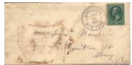
Lot 33 Rensselaer County 14 cover variety pack from John Nunes' estate for the benefit of ESPHS. Seven post offices from Berlin to Walloomsac, including a 19 th century run of Troy. Condition is OK to VF with some nice markings. There is content in half these FLS's & covers. Min: $35