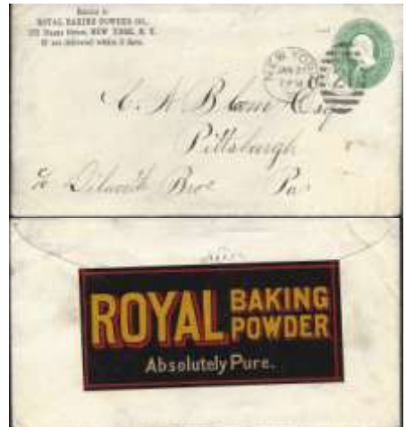
Lot 8 VF adv. poster stamp cover shown in Art Groten's article, p.18 March 2013 Excelsior . NEW YORK 1879 cds duplex with 21 ellipse killer. Min: $24