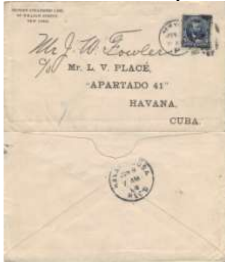
Lot 47 June 1900 advertising cover from NEW YORK to CUBA, with Receiver. Good #281 pays the freight. Min. $2