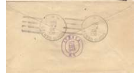
Lot 29 Multi-color franking obliterated with partial strikes of SCIPIO CENTER (Cayuga) 4-bar balloon on Registered letter to Ithaca. Irregular use as flap seal, with UTICA double circle. Min. $5