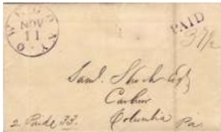
Lot 36 Violet OWEGO N Y (Tioga) with PAID 37½ of Nov 1842 to Columbia, Pa. Double-rated for enclosed draft; "33" may refer to senders Box. Bernadt rating B; Cat $60. Min. $25