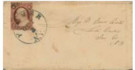
Lot 53 DPO 1819-1865. Scarcer blue FARMER / NY cds (Seneca) of the 1850's ties #10 to fragile lady's cover. Penciled arithmetic on reverse. Min. $25