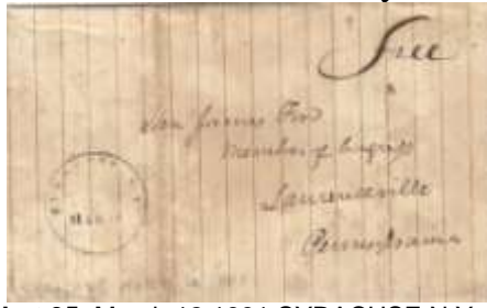
Lot 35 March 12 1831 SYRACUSE N Y (Onon) 30mm cds used 1830-32 only. Free to M/C at Lawrenceville, Pa. Contents propose sending letter bundles by alternate route. Interesting lined letter paper Min. $50