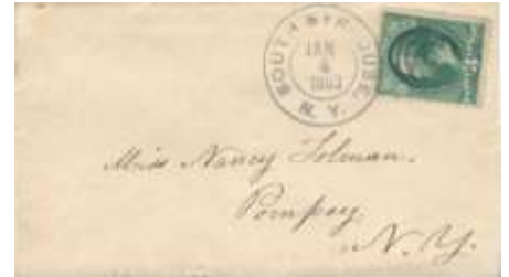
Lot 27 Pretty SOUTH SYRACUSE (Onon) duplex on lady's envelope to Pompey. Helbeck S/I-4. Few spots on reverse. Min. $4