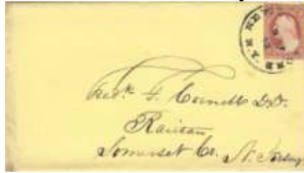
Lot 23 Letter datelined 1855 with NEW BALTIMORE (Green) cds tying #11A to lemon envelope to Raritan, NJ. Flap torn when opened, but complete. Min. $12