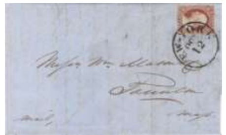
Lot 54 1850's era 30mm NEW-YORK cds ties #10 to FLS to Taunton, Mass. Sound. Min. $40