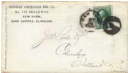
Lot 46 Clear NEW YORK duplex on c/c to Columbia, Ct. Very interesting negative "7" killer. Paper loss on flap. Min. $1