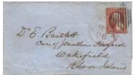
Lot 52 Legible red NEW YORK 30mm cds and black diamond grid tie #10 to folded cover sheet to Wakefield, R.I. Easily removed hinge on verso. Min. $30