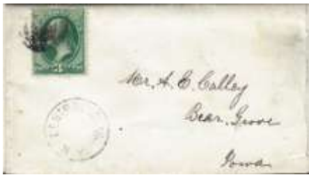
Lot 44 Scott #158 franks cover from CENTRAL SQUARE (Oswego) to Bear Grove, Iowa. Contents included in nice envelope opened on right. Min. $1