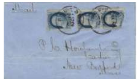
Lot 42 Pair of NEW YORK 28mm cds on 3 1¢ blues (#24 - bottom stamp faulty) to New Bedford. No contents, no year date. Min. $17