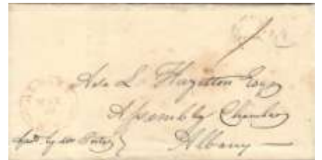
Lot 16 Red ALBANY / N.Y. with fleurons carried from NYC, deposited as drop letter and marked ms 1¢. Dated 1845 with comm'l contents. V. Nice. Min. $20