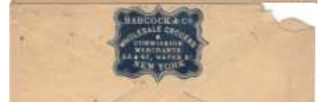
Lot 6 Nov 1860 partial strike of 32mm NEW-YORK cds (EKU Aug 8 1860) on nicked cover to Newark, Ohio. Full merchant's cameo on flap. Min. $4