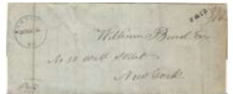
Lot 18 1833 30mm SYRACUSE / N.Y. (Onondaga) cds on 3 ½ x 8" folded letter to New York. Well struck raised letter PAID w. 37 ½ manuscript rate. Min. $10