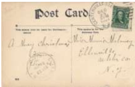
Lot 21 CENTERVILLE STATION / N.Y. (Sullivan) DPO 1894-1917. 1907 to Ellenville (30mm REC'D on front). Period greeting card artwork. Min $10