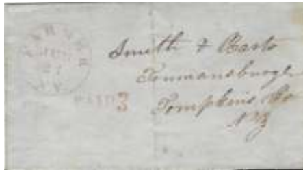
Lot 37 Legible FARMER N.Y. (Seneca) PAID 3 to Trumansburgh. Docketing on folded sheet dated 1852. No contents. Min. $20