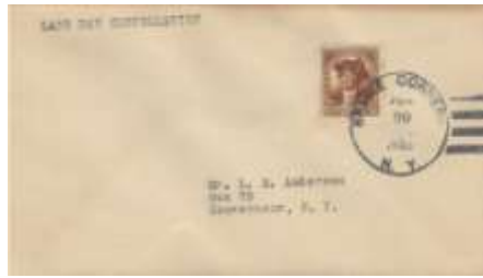
Lot 1 Last Day of Service Jun 29 1935 BRASIE CORNERS (St. Lawrence). #706 pays 3 rd Class Single Piece rate. Min. $3