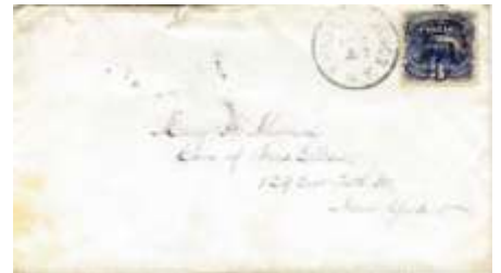
Lot 40 Ca. 1870 UNION SPRINGS / N Y (Cayuga) faint cds w/ duplex cork to New York City. Small tear at top. Min. $17