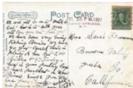
Lot 13 Well struck RFD of MADRID SPRINGS (St. Lawrence). 1907 color postal shows County Court House n Canton, NY. Min. $3