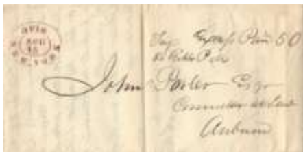
(*)Lot 22 Striking OVID / NEW YORK double oval of 1832; ASCC Listing item. PM Gibbs uses franking privilege for first 10¢ rate to Auburn and pays excess 50¢. Paper lost where sealed does not affect text. Min. $60