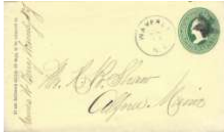
Lot 12 Legible WAVERLY (Tioga) cds with duplexed bold cork 5 point star killer on U83 to Alfred, Maine. Nice. Min. $15