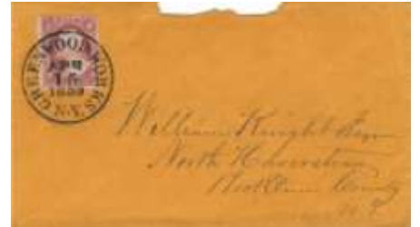
Lot 15 Stellar strike of GREENWOOD WORKS N.Y. (Orange) DPO 1854-1869 Envelope roughly opened. Min. $10