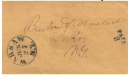
(*)Lot 11 Precisely struck dark blue WARSAW / N.Y. (Wyoming) cds with well struck PAID / 3 arc. Excellent condition. Min. $15