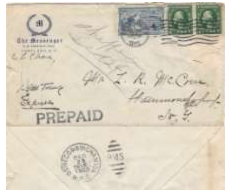
Lot 17 1915 CORTLAND double strike on c/c sent Spl. Delivery to Hammondsport. Large PREPAID and clear RMS on reverse. Severla small faults. Min. $30