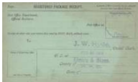
Lot 26 1895 Registered Package Receipt from Washington, NY to Canoe Camp, Pa. w/ Elmira & Blossburg RPO Agent stamp. Nice piece. Min. $15