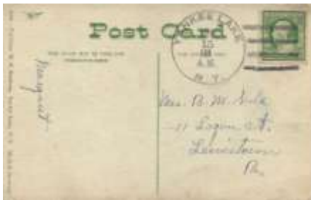
Lot 9 4-bar YANKEE LAKE (Sullivan) on picture post card f Smithem's Park lodge to Lewistown, Pa. Min. $7