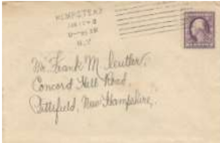
Lot 7 Columbia machine device used at HEMPSTEAD (Nassau) Jan 17, 1918. 3¢ violet pays the letter rate, including a 1¢ war surcharge. Min. $3