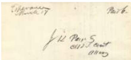
(*)Lot 10 Pristine Esperance / March 17 [1842] manuscript on Supreme Court document to Clerk of Court, Albany. Ms. Paid 6. Min. $10