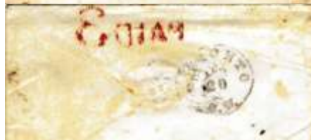
(*)Lot 2 OSWEGO / N. York on 1853 cover to Toronto with full letter sheet enclosure. Clear Exchange markings on front; Toronto receiver on rear with unrelated (?) red PAID 3. Min. $10