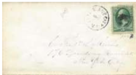
Lot 50 Legible LONG ISLAND CITY c-24 (Queens) w. cork killer on #147 to NYC. V. pretty monogram on reverse. Min. $3