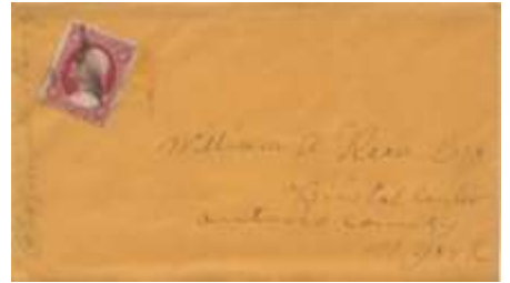
Lot 51 Manuscript Chapinville, Nov 24 (Helbock S/I - 1) with letter datelined Nov 24 1860. Don't miss this one. Min. $3