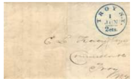
(*)Lot 30 Superb TROY N.Y. integral 2cts. Drop rate postmark on 1848 FLS. Good content on fine piece. Min. $30