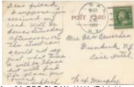
Lot 24 DPO SLOAN, / N.Y. (Erie) 4-bar balloon on 1912 post card to Dunkirk, NY. Sloan PO 1890-1914. Card shows colorized Buffalo post office. Min. $7