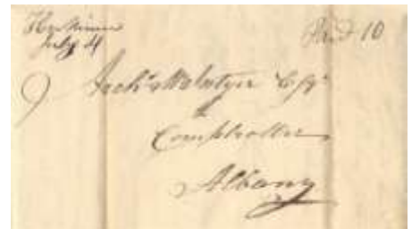
(*)Lot 41 XF condition Herkimer / July 4 1819 manuscript, Paid 10 to Albany. Writer seeks relief when "left on the hook for payments" Min. $5