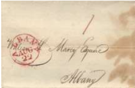
(*)Lot 20 1826 superb strike of 25mm ALBANY cds on drop-rated FLS. Enigmatic content regards deceased Sec. of State. Staining at right. Min. $5