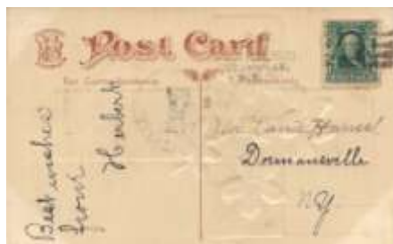
Lot 14 Light RFD GREENVILLE, NY (Green) on 1908 Easter card. Faint DORMANSVILLE postmark as receiver. Min. $3