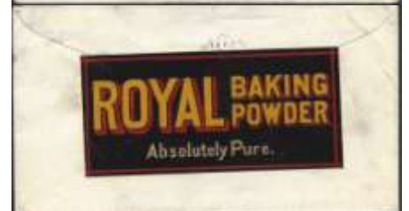
Lot 5 1879 NEW YORK cds and 21 ellipse killer on Royal Baking Co cover with their poster stamp. Min. $24