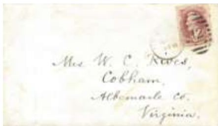
Lot 38 VF #159 pays double rate from NEW YORK to Virginia. Numbered ellipse killer. Min. $12