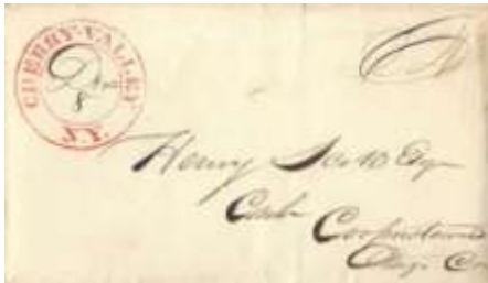
(*)Lot 32 Elegant 1832 CHERRY VALLEY / N.Y. (Otsego) FLS to Coopers-town. Banking content. Min. $15