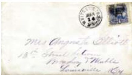
Lot 33 WHITNEY'S POINT (Broome) to Louisville. 1870 per docket on reverse. Reduced at right to open. Min. $17