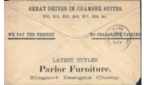
Lot 4 1896 JAMESTOWN C-27 with duplexed target tying #252 to neat all-over advertising cover. Sliced open at left with small tear. Min. $15