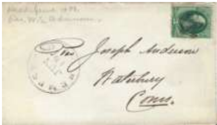
Lot 45 Complete 33mm HEMPSTEAD / N Y of 1873 w. grilled 3¢ green (#136) hit SON by 5 point cark star killer. Grill pts evident near Washington's chin & mouth. Carefully opened right. Min. $30