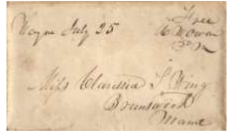
(*)Lot 28 Manuscript Wayne July 25 Free / U. W. Owen / PM on faultless 1838 FLS to Brunswick, Maine. Mr. Owen orders a cap. Min. $10