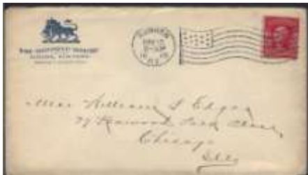
Lot 34 Clear AUBURN (Cayuga) flag cancel May 10 1908 on c/c of The Osborne House . Slight toning. Min. $3