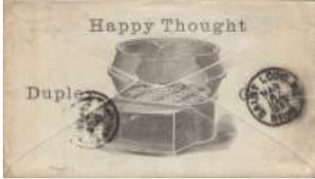
Lot 31 1887 UTICA, N.Y. (Oneida) all over advertising cover to St. Louis, Mo. St. Louis REC'D together with muddled cds on reverse. Cat. $180; Min. $80