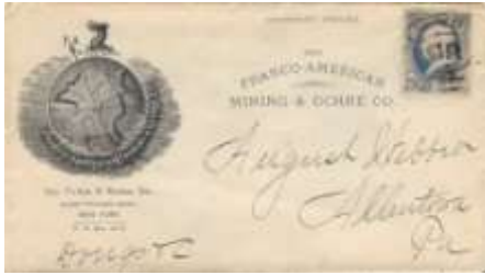
Lot 19 Beautiful (unsealed) c/c cover from NYC w. NEW YORK mute double oval canceling 1¢ blue to Allentown, Pa. Cat. Value $100; Min. $55