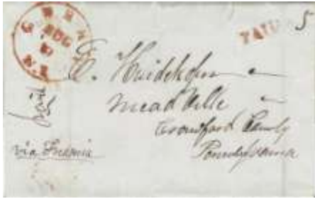
Lot 43 1848 GERRY / N.Y. 32mm cds (Chautauqua) w. PAID stamp and ms 5 rate to Meadville, Pa. Note routing "Via Fredonia". Listing item in red. No contents. Min. $20