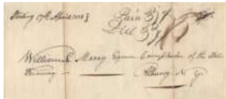
(*Lot 48 EKU. Oversize FLS (3 x 7" if folded) bears XF Sterling 17 th April 1828 (Cayuga) to Albany. Letter contained $25 of bank bills, resulting in re-rating in Albany. Good content but no money! Min. $10