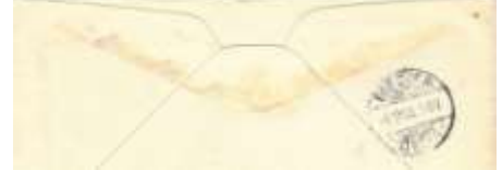
Lot 39 Neat blue attorney c/c with good strike of BUFFALO (Erie) to Dresden (receiver on reverse). #304 pays UPU rate to Germany. Flap removed. Min. $4.50