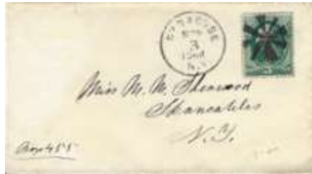
Lot 49 Perfectly struck pinwheel kills 3¢ green (#147) on lady's cover to Skaneateles from SYRACUSE (Onondaga). Min. $9