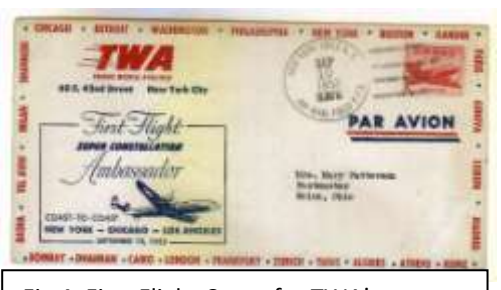
Fig 4. First Flight Cover for TWA's coast to coast inaugural flight.

Our final example can be found as Figure 4, another First Flight Cover, this one commemorating Trans World Airlines' inaugural Super Constellation (Lockheed L-1049) Coast-to-Coast trip. In addition to being an attractive air mail cover, this one came, like a Cracker Jacks Box, with a prize inside, an official TWA enclosure advertising the flight (Figure 5).