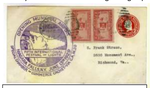
Fig 3. Cover commemorating the opening of Niagara Falls Muni. Airport.

marking, which takes a bit of deciphering, provides us with some history about the New York originating airport. The 'IDL' stands for