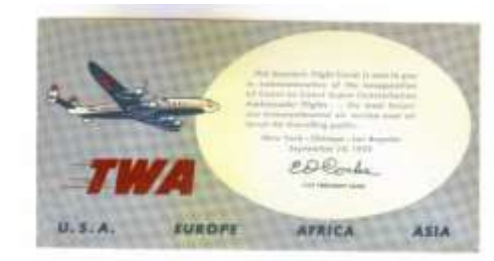
Fig 5. Right, the surprise insert from TWA.

come by, covers like the ones shown are just plain old fun to collect!