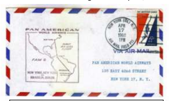
Fig. 1. New York to Brasila.

The United States Post Office Department awarded air mail routes to various airlines, the ones flying abroad being designated as FAM's (for 'Foreign Air Mail'). Regular FAM-5 contracted service began on May 21, 1929 and was awarded to the now defunct Pan American