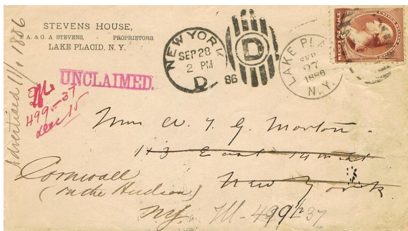
Figure 1 Front of cover sent from Lake Placid.

Long time member Bill Hart, years ago, introduced me to the joys of seeking out “well traveled covers”. After all, what is better to a postmark collector than to have a gaggle of postmarks on one cover. This example has 9 postmarks, 6 killers, 1 UNCLAIMED and 4 manuscript notations.