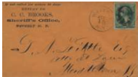
Lot 26 25mm WAVERLY (Tioga) CDS 3¢ green tied by circle-of-V's on Sheriff's Office corner card. Overall fine Min. $20