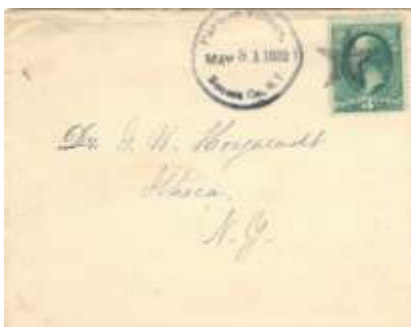
Lot 13 30mm Farmer Village, Seneca Co., N.Y. MAY 31 1882 CD duplex with 5 point star. Well inked. ITHACA, NY CDS on back. Scarce DPO 1865-92. Min. $25