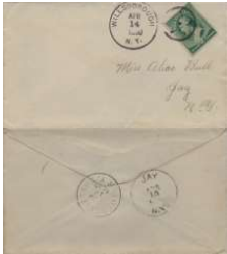
Lot 24 Purple-black WILLSBOROUGH 1890 year-dated duplex CDS. Star-in-circle w/ central dot. Essex Co. DPO 1806-93. Back show Ausable Forks & Jay, NY stamps. Min. $15