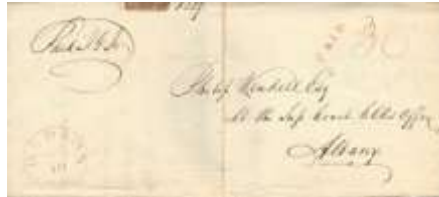
Lot 15 Red HUDSON CDS on turned ALBANY oversize FLS. Ms. Red 30 rate marked PAID Oct. 1839 legal content. Min. $18