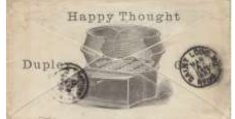
Lot 32 1887-dated UTICA, N.Y. (Oneida) duplex CDS w/ 2-in-ellipse killer. All-over advertising cover. SAINT LOUIS REC'D $180 catalog, Min. $70