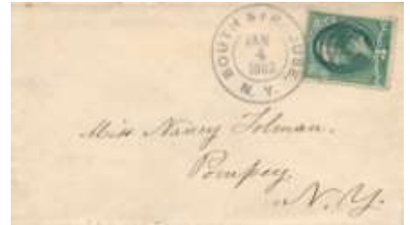
Lot 30 S./I 4 DPO SOUTH SYRACUSE (Onondaga) double circle duplex CDS JAN 4 1883. Slight spotting on verso. Min. $1