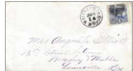
Lot 20 WHITNEY'S POINT (Broome) with apostrophe. DPO 1824-94. Docketed 1870 to L'ville, Ky. Min. $15