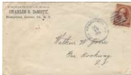
Lot 16 1885 town-county postmark HEMPSTEAD, / QUEENS COUNTY N.Y. Duplexed w/ 7 bar grid. Min. $11