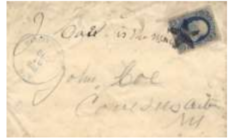
Lot 18 WAYLAND DEPOT (Steuben) year-dated CDS. Strong 5 point star on 1¢ blue paying circular rate (flap unsealed) DPO 1848-84. Conesus Center Rec'd on verso. Min. $20