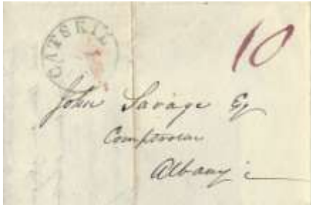
Lot 10(*) 1822 use of greenish CATSKILL JAN 16 32x30 Oval Magenta 10 rate on FLS – scarce combination. Min. $10