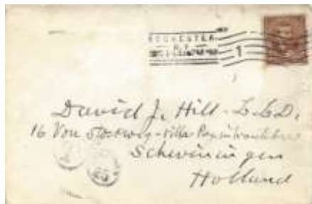
Lot 17 Early Barry machine (Aug '98) of ROCHESTER (Monroe) ties pre-UPU Bureau issue on cover to Scheveningen, Holland. 25 centime DUE (T in circle). 3 related marks on verso. Min. $4