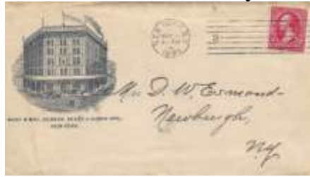
Lot 14 Early International machine of NEW YORK (May 1895) on advertising cover to Newburgh, with Receiver on verso. Min. $10