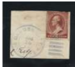
Lot 27 GARDEN CITY / QUEENS CO., N.Y. postmark on piece with 2¢ brown. Min. $5 ML2