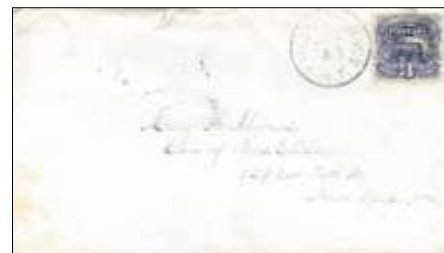
Lot 28 Legible UNION SPRINGS (Cayuga) CDS to NYC. Partial RECEIVED on verso. Min. $15