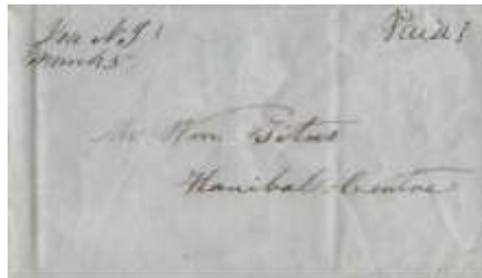
Lot 29(*) Manuscript Ira N Y / March 5 (Cayuga) 1855 Paid FLS to Hanibal Centre [sic] Sound & clean. Min. $5