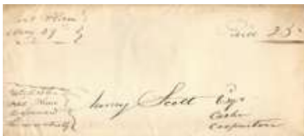
Lot 12(*) Msc. Fort Plain/May 29 [1833] (Montgomery) FLS to Cooperstown. Last Known Use. Min. $5