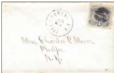
Lot 23 FIVE CORNERS (Cayuga) ladies cover with XF/S #114. Almost fancy cork cancel. Scarce DPO 1825-1907 Reduced at left. Min. $70