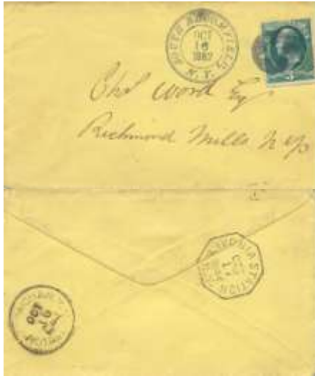
Lot 22 Almost perfect SOUTH BLOOMFIELD (Ontario) duplex CDS. DPO S/I 4 CANANDAIGUA TRANSIT and LIVONIA STATION octogon. Reduced right not affecting 3¢ banknote. Min. $4