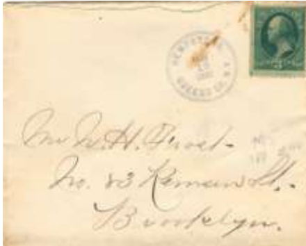
Lot 11 1881 double ring county postmark HEMPSTEAD / QUEENS CO. N.Y. duplexed to 5 point star killer. BROOKLYN REC'D on verso. Min. $10