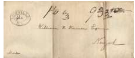
Lot 31(*) LOWVILLE / N.Y. (Lewis) double oval w/ msc Feb 14 date [1826] to New York. $1.12½ rate changed to 93¼¢ Worth investigating. Water stain lower left. Min. $20 KH7