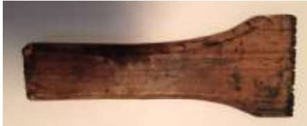
Lot 28 West Leyden, N.Y. 5x41mm s/l possibly used to apply Return Address? A few defects from hard use. Min. $9.95 Shipping weight 2 oz.