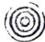
Lot 27 17mm 4-ring killer, commonly seen in the 1860s. This one has nicks around the outer circle; 4½ " turned handle. Min. $19.95 Shipping weight 2 oz.