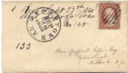
Lot 22 Superb 32mm WATERTOWN/NY (Jefferson) on ladies env. to Odensburg. Dbl strike of closed grid on #26; plenty of docketing on face. Min. $25