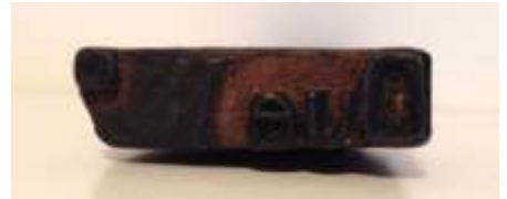
Lot 26 Due stamp with room for rate to be added. Office of use not identifiable. Min. $14.95 Shipping weight 2 oz.