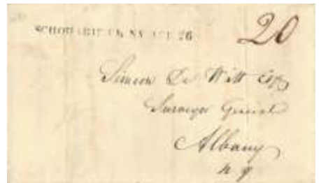
Lot 21(*) Very nice SCHOHARIE CH NY APR 26 to Albany in 1833. Routine business content double rated for enclosure. Min. $75