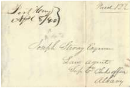
Lot 10(*) Ms. Port Henry / Apl 8/40 to Albany. Legal boilerplate with considerable addenda from Essex Co. Min. $10