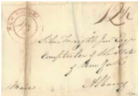
Lot 23(*) 33x22mm NEW ROCHELLE N.Y. (Westchester) DCDS Apr 6 1832, 12½¢ to Albany. Company business on 2 half-sheets rated as 1. Min. $50