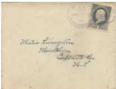
Lot 13 Light but almost complete strike of violet 30mm MCGRAWVILLE, NY (Cortland) duplex CDS w/ fleuron and M. C. Bingham, PM dated Jan 17 1888. #206 pays 1¢ circular rate (flap unsealed). Marathon, NY receiver on verso. Min. $30