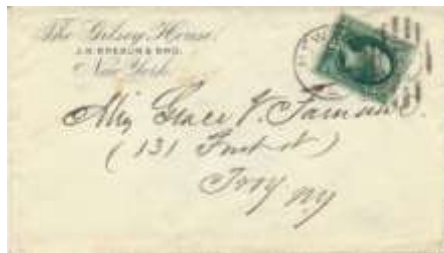
Lot 16 New York City duplex of 1881 with letter E ellipse ties #184 3¢ green to Gibsey House corner card to Troy, NY. 2 marks on verso. Min. $20