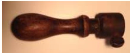
Lot 29 FOREST PORT / N.Y. (Oneida) 1855 – 1894, when name was revised to FORESTPORT (1894 To Present). This 27mm device is in superb working condition, missing only the slugs needed to set dates. Min. $79.95 Shipping weight 7 oz.