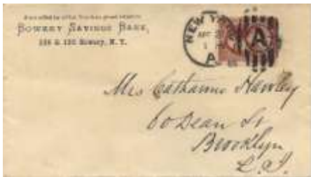
Lot 12 Well inked New York 1885 duplex letter A ellipse on Bowery Savings Bank c.c. to Brooklyn. Wesson type REC'D at B'lyn same day 4 hrs later!. Min. $20