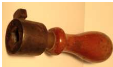
Lot 25 WEST LEYDEN, N.Y. (Lewis Co. 1825 to Present) 25mm cds. Excellent working condition, but missing the date slugs that would have been included with original purchase. Min. $79.95 Shipping weight 8 oz.