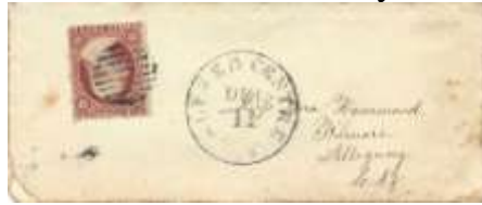
Lot 14 Complete 30mm ALFRED CENTRE/N.Y. CDS (Allegany) on ladies cover to Filmore. 8-bar open grid on #26. DPO 1850-1893. Min. $15