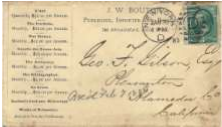
Lot 11 NYC 1883 duplex with letter E ellipse on publisher's interesting advertising cover to Pleasanton, Calif. Slight soil lower right, otherwise VF. Min. $35