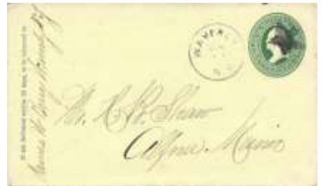
Lot 20 Light 25mm duplex of WAVERLY N.Y. (Tioga) w/ bold 5 point star on U83 stationery to Alfred, Maine. Circa 1870. Min. $15