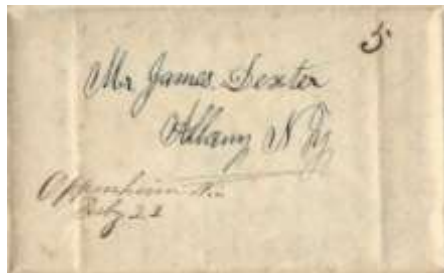
Lot 17 (*) Oppenheim NY/ Feb'y 22 [1848]. Local matters in great detail, all for 5¢ postage. Min. $5