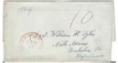
Lot 19 2 covers, both with interesting content. 1844 ALBANY to N. Adams, Ma in VF condition. Florence Ny (Oneida) on 1849 letter to Racine, Wisc. rated 10 (> 300 miles). A few faults. Min. $6 for both.