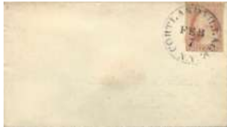
Lot 15 Solid CORTLAND VILLAGE (DPO 1880) dated to 1855 by #11A Relief A dull orange red shade. Small ladies env. Min. $3