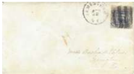
Lot 18 JAMESTOWN/N.Y. (Chatauqua) w/ 4-bar cork killer ties #114 on ladies cover to Irvington, Pa. Reduced cleanly on left. Min. $15