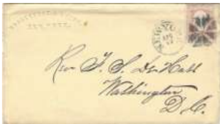
Lot 24 Circa 1863 NEW-YORK CDS with a very well struck carved boxwood killer tying straight edge #63 to albino embossed HASLEHURST & SMITH corner card cover to Washington, D.C. Min. $3

These are genuine used 19 th century post-marking devices with 100+ year old ink from New York State post offices. Offered by an ESPHS member from a 30 year old collection never before offered.